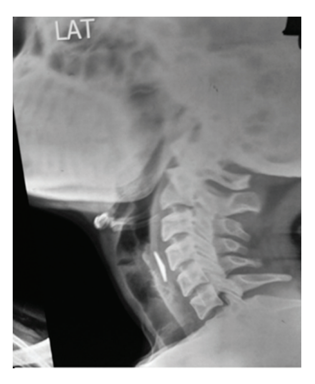
Figure 1: Foreign body in soft-tissue neck lateral view radiograph.